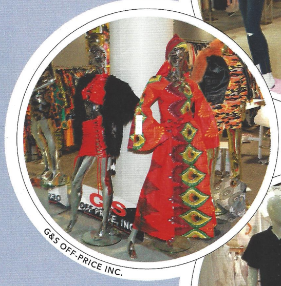
G&S OFF-PRICE INC.